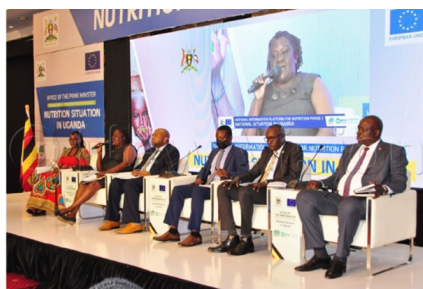
Participants in the dialogue

In September, NIPN Uganda organised the national nutrition dialogue. At the event, UNICEF asked Government to increase funding for nutrition, and Ugandan Prime Minister Robina Nabbanja pledged to work with other ministries to create a department in the Ministry of Health for managing nutrition. The Government is committed to tackling high rates of malnutrition through a multisectoral approach, reflected in the second Uganda Nutrition Action Plan (UNAP) 2020-2025, the PM noted, as reported by the major daily New Vision. 'We must be embarrassed to hear cases of stunted children', she added. Read the full article HERE .