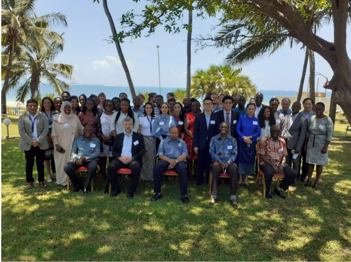
NIPN Global Gathering Mombasa, Kenya