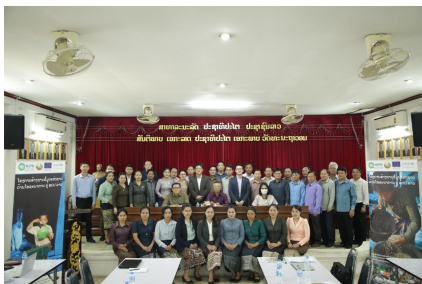
Participants from the workshop

Diffusion du PNIN aux collèges et universités de la RDP Lao