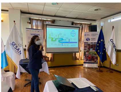
Presentation at the workshop

Partage d'expériences sur l'utilisation des données sur la sécurité alimentaire et nutritionnelle