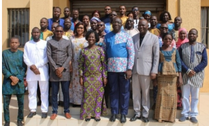
Participants of the workshop

workshop in Ouagadougou with the aim of developing the Burkina Faso nutrition scorecard and strengthening the use of existing data for accountability, action and advocacy. At the end of the workshop, the 40 participants were able to develop a nutrition scorecard for Burkina based on the selection of indicators from the multisectoral nutrition strategic plan.